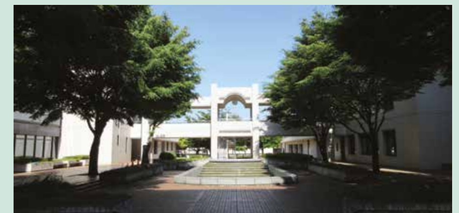
Campus photo of Ehime Prefectural University of Health Sciences